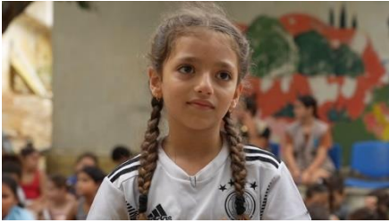
A young participant at the Wells of Hope awareness session on human trafficking at Dbayeh Camp outside of Beirut, Lebanon, 19 July 2024.

Lebanese face impossible situation, as conflict intensifies Ottawa, October 8, 2024 – The Catholic Near East Welfare Association (CNEWA Canada) has launched an emergency campaign to raise funds for displaced families in Lebanon, immediately releasing $100,000 to procure bedding, food, potable water, nursing formula and medicines.