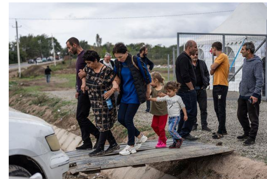
Residents of Nagorno-Karabakh were forcibly displaced into Armenia, October 2023, as a result of Azerbaijan's occupation. CNEWA has supported refugees in the Middle and Near East since 1926.

Refugees are deeply connected to both our Christian tradition and the daily realities of our modern world. Their plight is not just a historical or scriptural narrative but a pressing issue that resonates with contemporary global challenges.