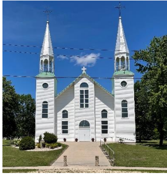
Diocese web site: www.archsaintboniface.ca