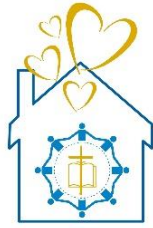
Households of Faith