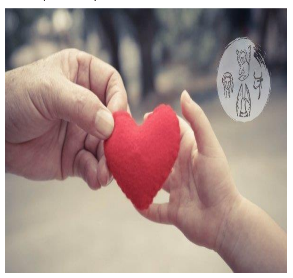
May the Lord fill our hearts with his love and mercy!

"Love your enemies, do good, and lend, expecting nothing in return. Your reward will be great, and you will be children of the Most High; for he is kind to the ungrateful and the wicked. Be merciful, just as your Father is merciful" (Luke 6:35-36).