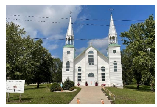
Diocese web site: www.archsaintboniface.ca